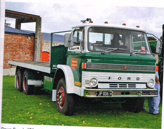
Doug Gray's "D" series. Note the special V8 badge on the grille

The truck was restored by several mates with some help from Doug. □