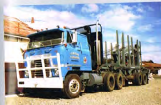
Fearon Logging, for a time, operated this Detroit powered Transtar II. It was previously operated by...