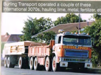
Burling Transport operated a couple of these International 3070s, hauling lime, metal, fertilizer, etc