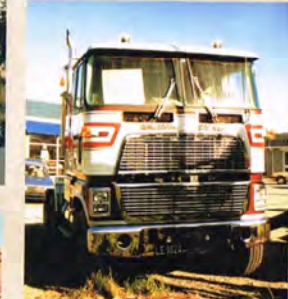
'Whistlin' Dixie' was for sale on the Kapiti coast when this was taken