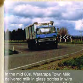
In the mid 80s, Wararapa Town Milk delivered milk in glass bottles in wire crates to the towns of the lower Wairarapa valley. Their 1982 Isuzu crosses the centreline near Battersea on a return trip from Martinborough