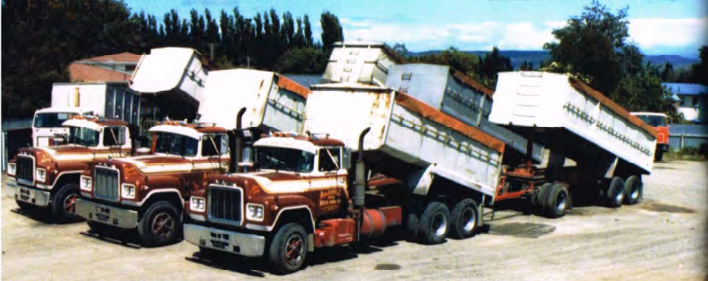
A & J Hill of Palmerston North were strong supporters of the bulldog breed