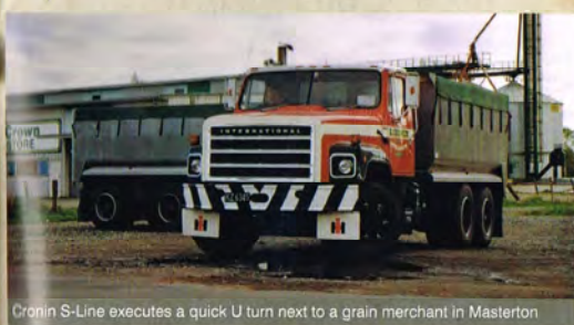
Cronin S-Line executes a quick U turn next to a grain merchant in Masterton