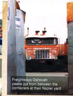
Freightways Oshkosh peaks out from between the containers at their Napier yard