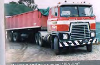
...B Cronin and was named "Big Jim"