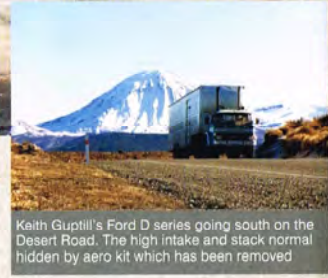
Keith Guptill's Ford D series going south on the Desert Road. The high intake and stack normal hidden by aero kit which has been removed