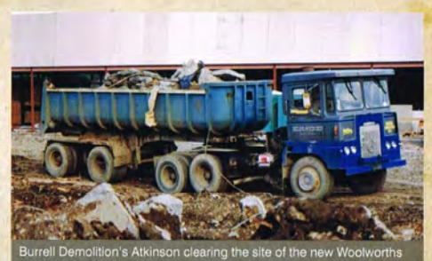
Burrell Demolition's Atkinson clearing the site of the new Woolworths supermarket in Masterton