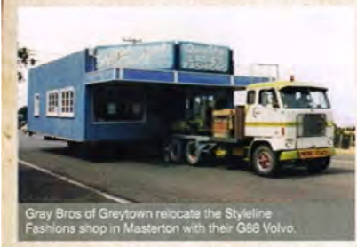
Gray Bros of Greytown relocate the Styleline Fashions shop in Masterton with their G58 Volvo.