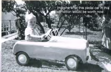
Imagine what this pedal car in this condition would be worth now.

In the 1970s I bought a great little view-finder Minolta from a friend. This was a brilliant camera for holiday pictures, but a bit limited if you wanted to take pictures of trucks on the move. Finally I had saved enough to buy my first SLR. With the assistance of a friend in the photography business I purchased a Nikon EM. At last I could take some good photos!