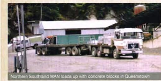
Northern Southland MAN loads up with concrete blocks in Queenstown