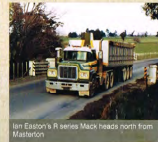
Ian Easton's R series Mack heads north from Masterton