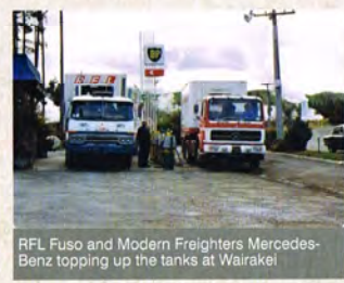
RFL Fuso and Modern Freighters Mercedes-Benz topping up the tanks at Wairakei