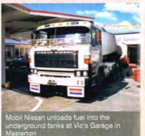
Mobil Nissan unloads fuel into the underground tanks at Vic's Garage in Masterton