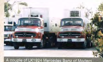
A couple of LK1924 Mercedes Benz of Modern Freighters at their yard in Levin