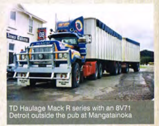
TD Haulage Mack R series with an 8V71 Detroit outside the pub at Mangatainoka