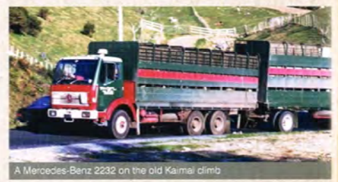
A Mercedes-Benz 2232 on the old Kaimai climb