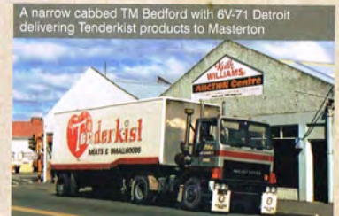
A narrow cabbed TM Bedford with 6V-71 Detroit delivering Tenderkist products to Masterton