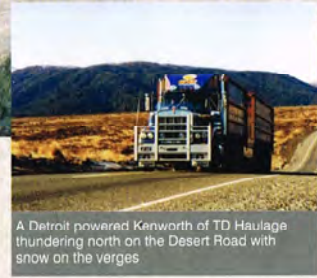
A Detroit powered Kenworth of TD Haulage thundering north on the Desert Road with snow on the verges