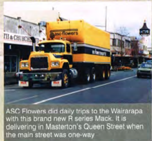
ASC Flowers did daily trips to the Wairarapa with this brand new R series Mack. It is delivering in Masterton's Queen Street when the main street was one-way