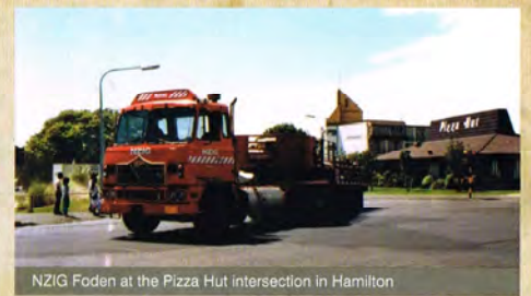
NZIG Foden at the Pizza Hut intersection in Hamilton