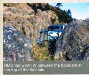
RMD Kenworth W between the boulders at the top of the Kaimais