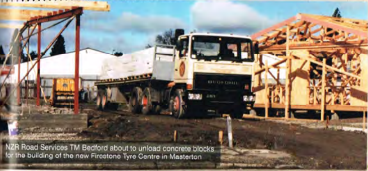
NZR Road Services TM Bedford about to unload concrete blocks for the building of the new Firestone Tyre Centre in Masterton