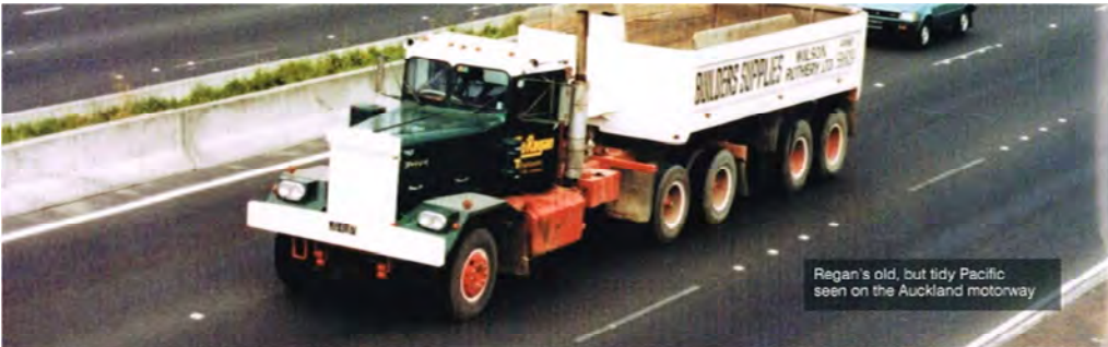
Regan's old, but tidy Pacific seen on the Auckland motorway