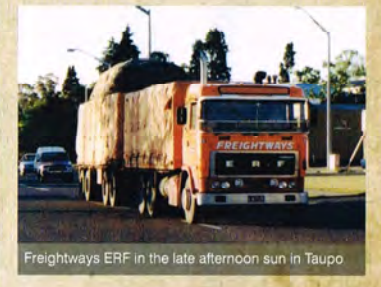
Freightways ERF in the late afternoon sun in Taupo