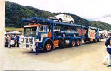
Car Haulways Mack MC with a load, ready for a truck parade in Lower Hutt. When this appeared on my blog I was contacted by the little guy leaning on the bullbar, who was thrilled to see it.