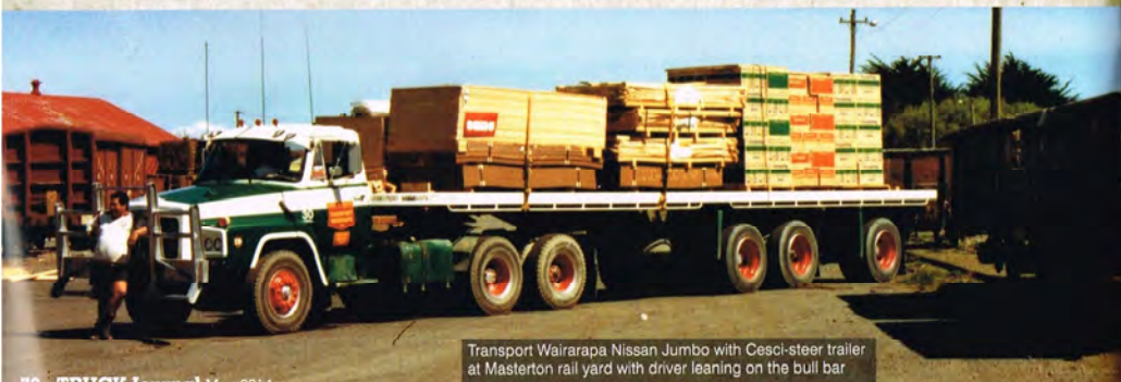
Transport Wairarapa Nissan Jumbo with Cesci-steer trailer at Masterton rail yard with driver leaning on the bull bar