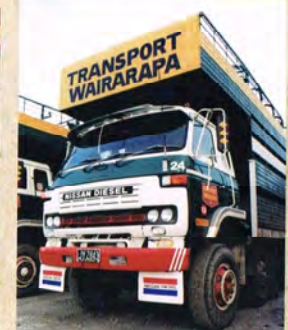
Eight wheeler Nissans, like this example, were the flagships of the Transport Wairarapa fleet in the 80s