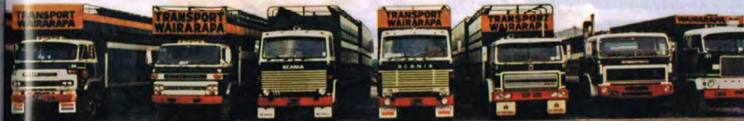
A mix of breeds in the Transport Wairarapa fleet